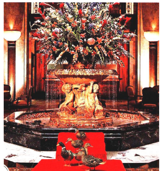
A picture of the famous Peabody ducks near fountain in the lobby of the Peabody Hotel.

We have also created a 75 th Anniversary Celebration event on Facebook to help brothers reconnect in advance: http://www.facebook.com/event.php?eid=184171038723&ref=mf