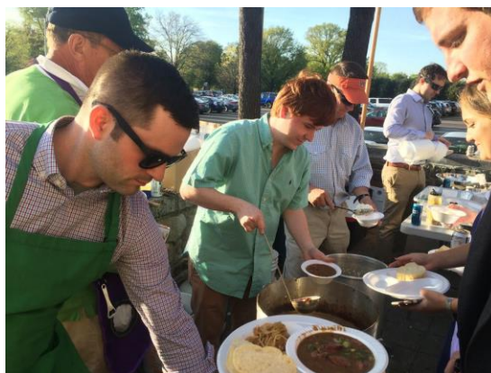
Brothers working together during the Wild Game Dinner