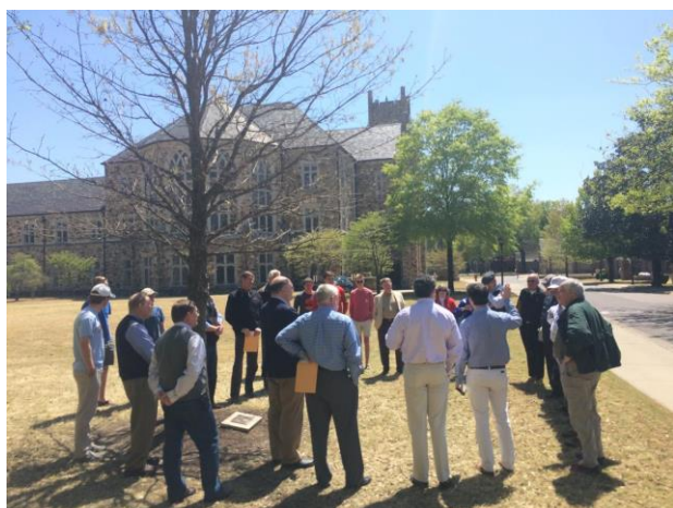
Remembering Brothers at the White Oak of Sigma Nu