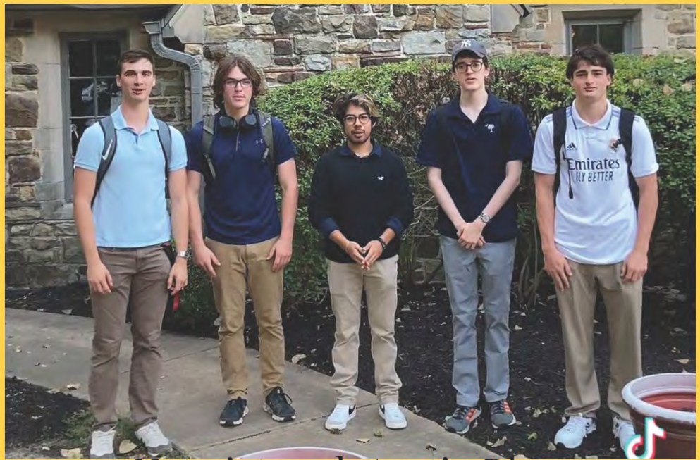
Not pictured: Austin Rhea

We recently inducted six new candidates into our fraternity, the most out of any IFC fraternity on Rhodes campus. We hope you get to meet them soon!